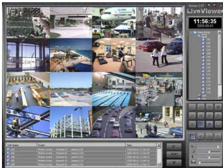
LiveViewer Remote Monitoring Software can support up to 64 cameras from multiple DVR servers