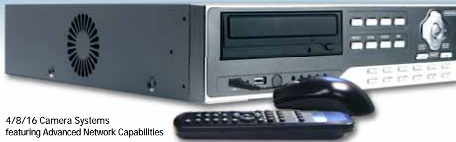
4/8/16 Camera Systems featuring Advanced Network Capabilities